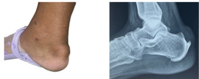
Fig. 3: Clinical (left) and X-ray (right) picture of Insertional Achilles Tendinopathy with Haglund deformity

BMI: Body Mass Index, IAT: Insertional Achilles Tendinopathy